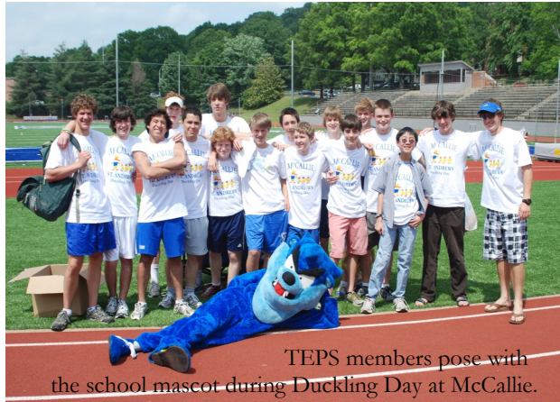
TEPS members pose with the school mascot during Duckling Day at McCallie.